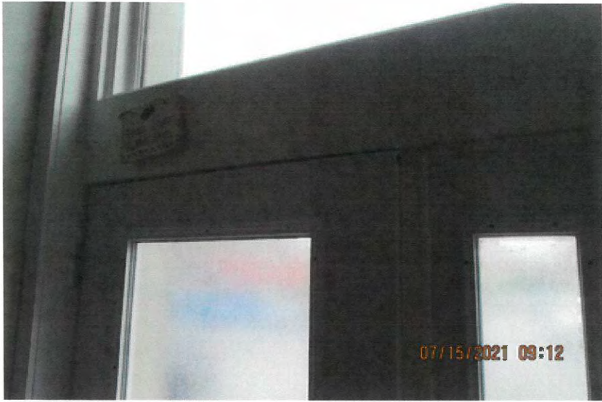
7/19/2021, 12:38:23 PM