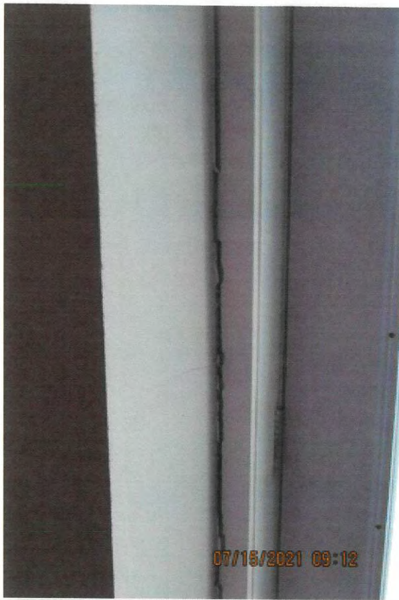
7/19/2021, 12:38:23 PM