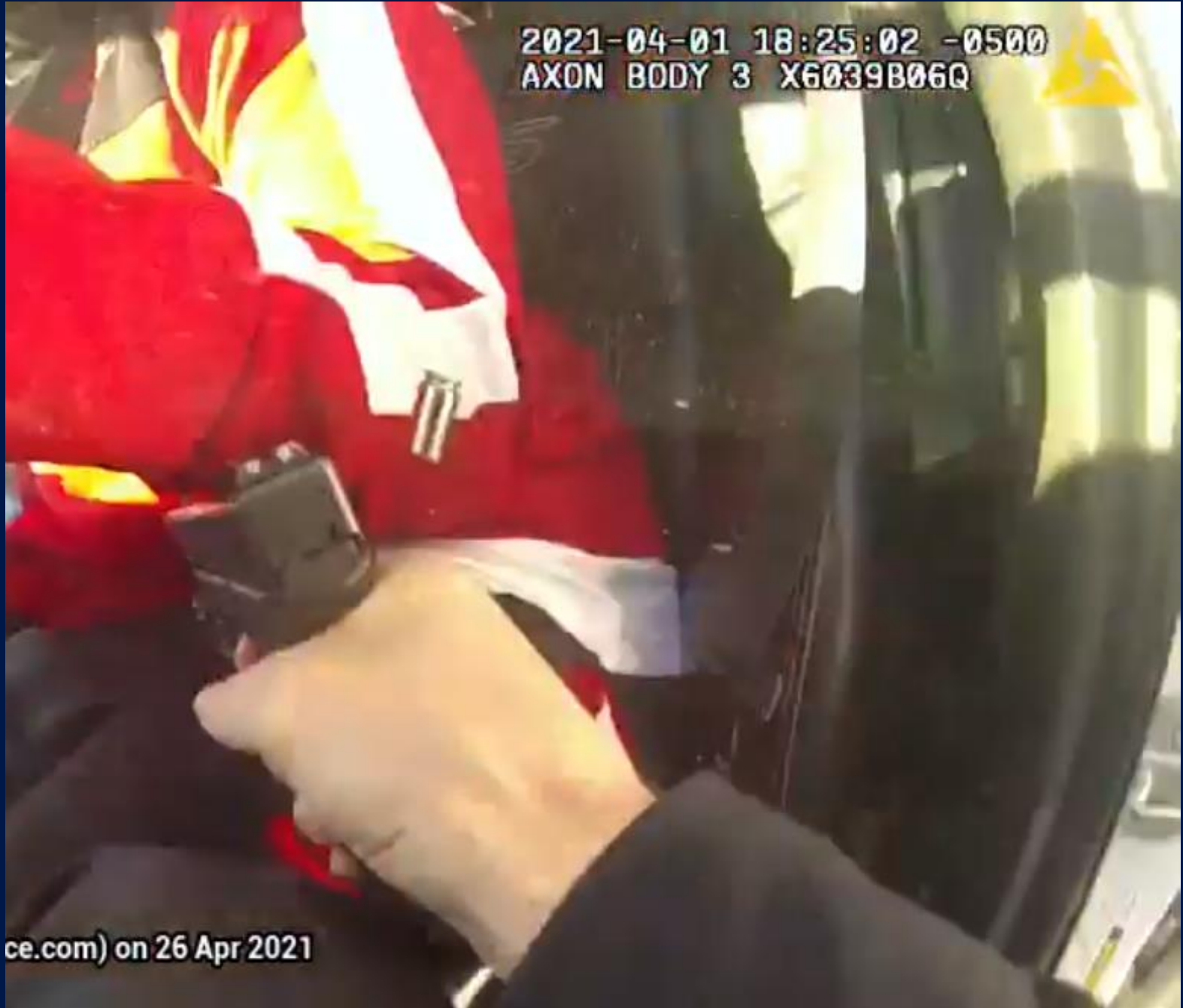
Stills from Waddle's BWC